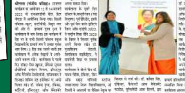
दिल्ली पब्लिक स्कूल में एचआरडीसी, डीपीएस सोसाइटी, नई दिल्ली की ओर से इंडकॉन कार्यक्रम का आयोजन किया गया।