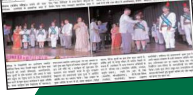
दिल्ली पब्लिक स्कूल के विद्यार्थियों ने विशाल अलंकरण समारोह का भव्य आयोजन किया।