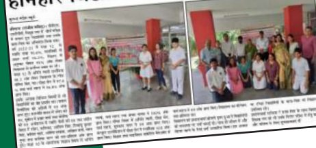
विद्युत नगर विद्यालय के विद्यार्थियों को उनके श्रेष्ठ प्रदर्शन के लिए अभिनंदित किया गया।