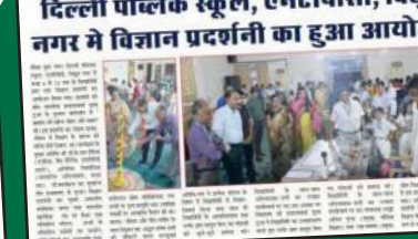
दिल्ली पब्लिक स्कूल, एनटीपीसी, विद्युत नगर में विज्ञान प्रदर्शनी का हुआ आयोजन।