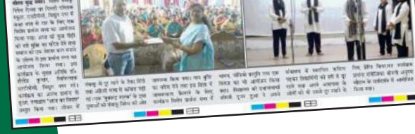
विद्युत नगर विद्यालय के विद्यार्थियों ने 'नुक्कड़ नाटक' के माध्यम से युवाओं को तंबाकू के हानिकारक प्रभावों के प्रति जागरूक किया।