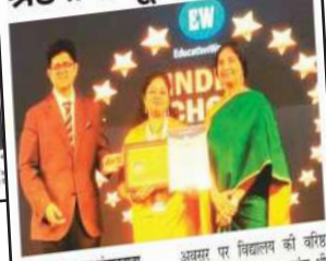
डीपीएस, एनटीपीसी में श्रेष्ठ प्रदर्शन के लिए विद्यार्थियों को सूची में नंबर 1 का पुरस्कार मिला।